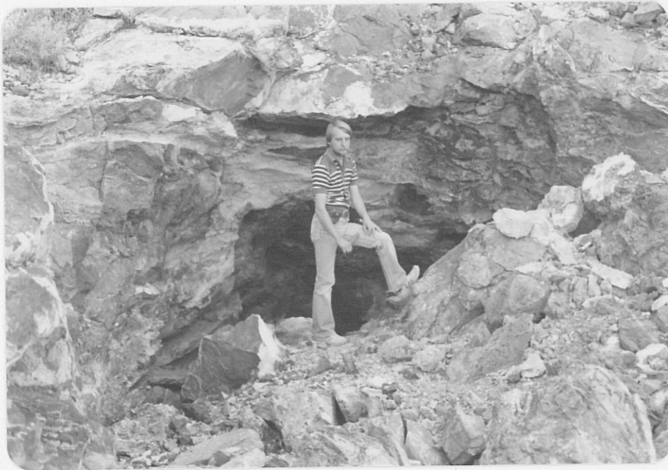
Photo (f) Small inclined shaft, 5' x 6', in E \frac{1}{2} SE \frac{1}{4} , sec. 25.