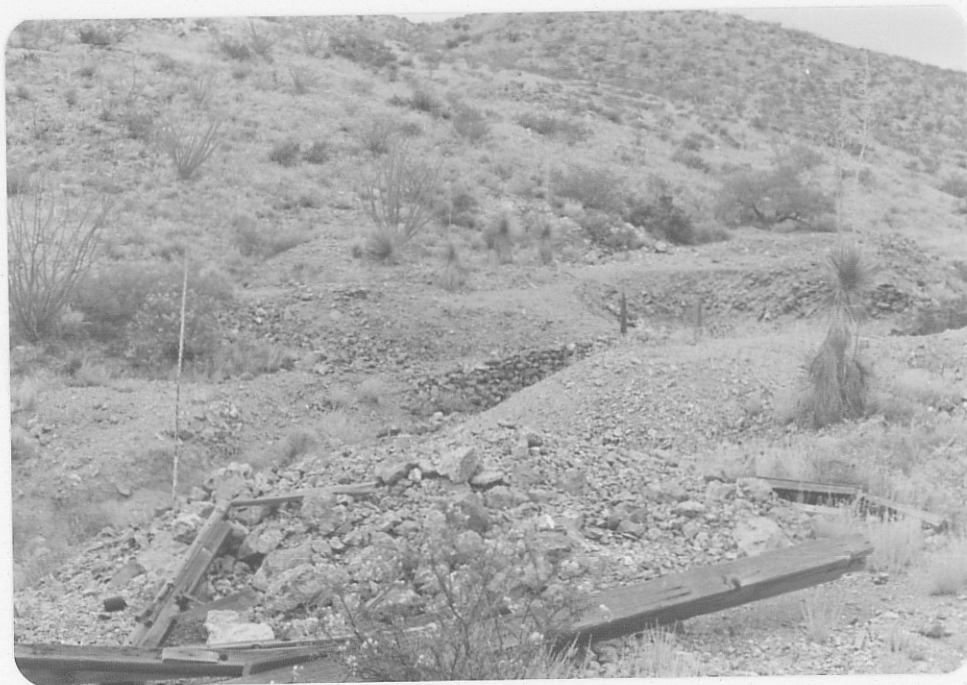
Photo (e) Tailings dump from workings shown in photos (c) and (d).