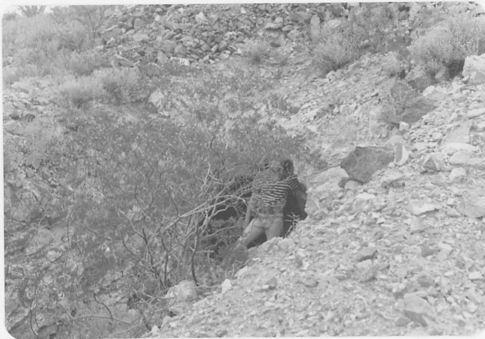
Photo (j) Small adit with a heading of 335^{\circ} , portal 5' high, 6' wide, in E\frac{1}{2} SW\frac{1}{4} , sec. 25. Ore in tailings pile is iron rich.