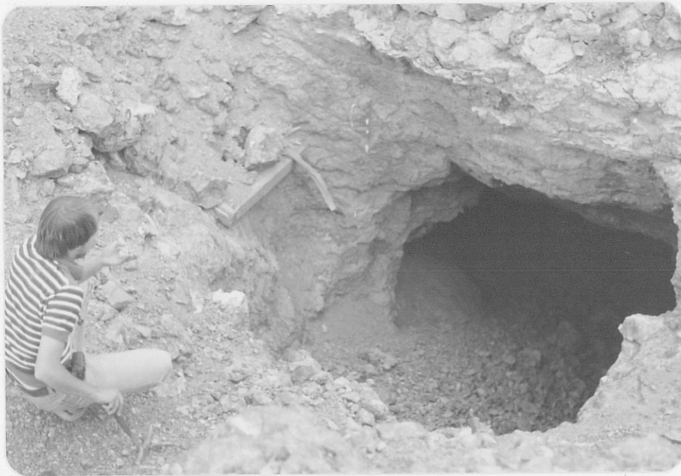
Photo (d) In 8' x 12' open pit with small decline at east face; underground workings only 10' - 12' long. Area is immediately south of decline shown in photo.