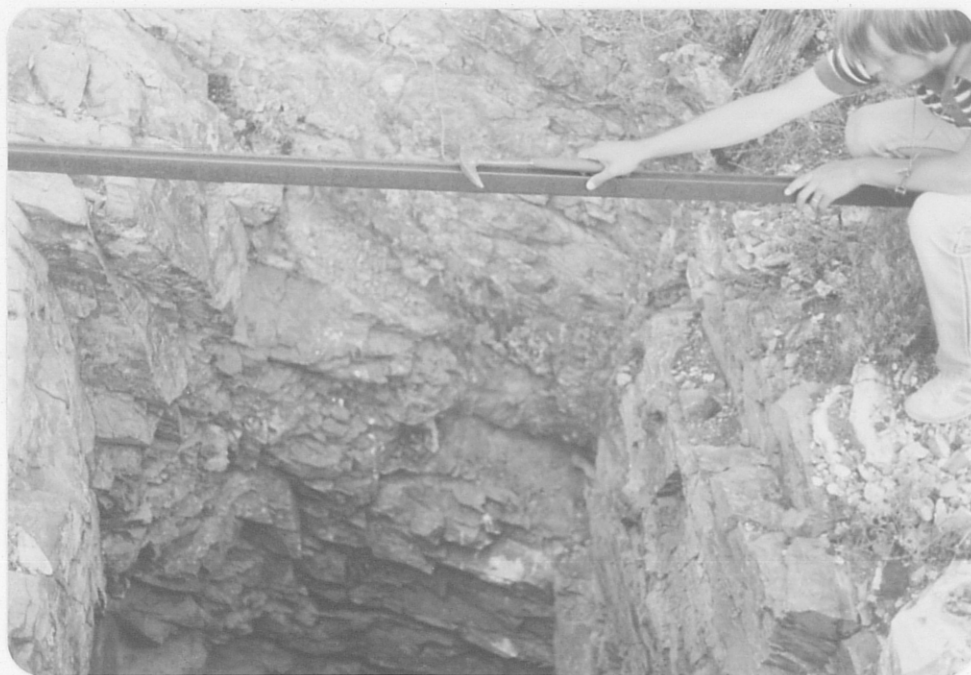
Photo (i) Vertical shaft, 6' x 6', at least 50' deep, in E \frac{1}{2} SW \frac{1}{4} , sec. 25.