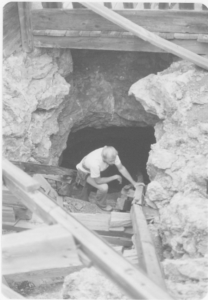
Photo (c) Entrance to 30° decline with a due east heading; workings are 100' west of shaft shown in photo (b).