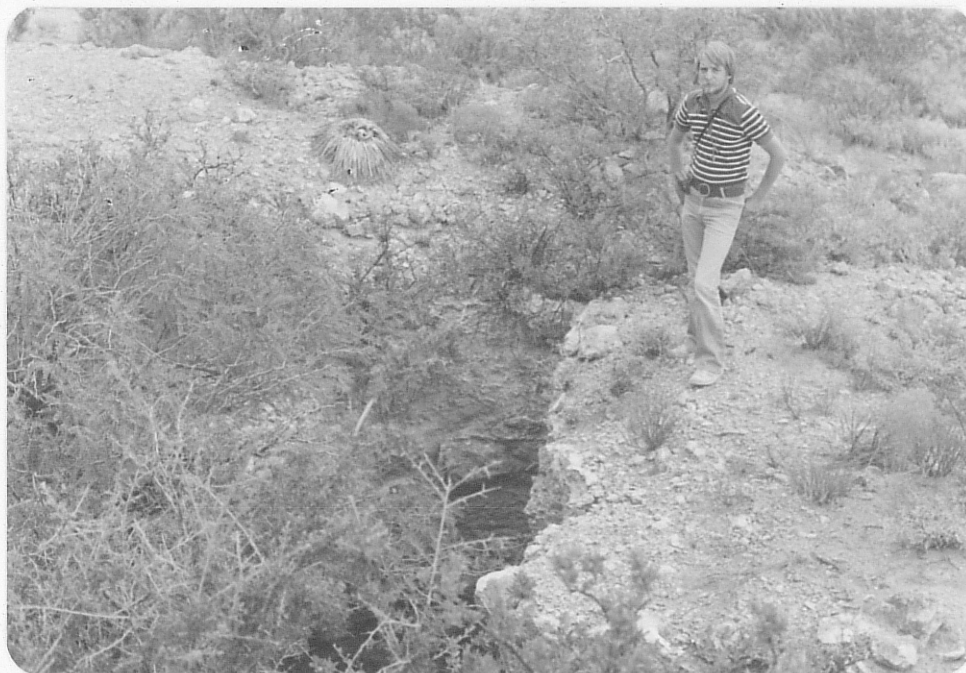
Photo (a) Looking northward at incline shaft 250' to west of access road in SE \frac{1}{4} sec. 25 as mining district is approached; site is nearby an abandoned trailer house. Sign on approach advertises the Cruz Blanca Mining Co.