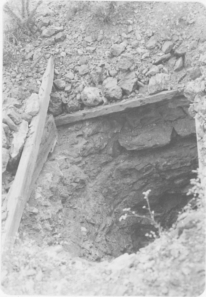
Photo (b) Vertical shaft, 4' x 6', 50' deep; in cluster of workings east of abandoned trailer house near the International Boundary, in SE \frac{1}{4} sec. 25.