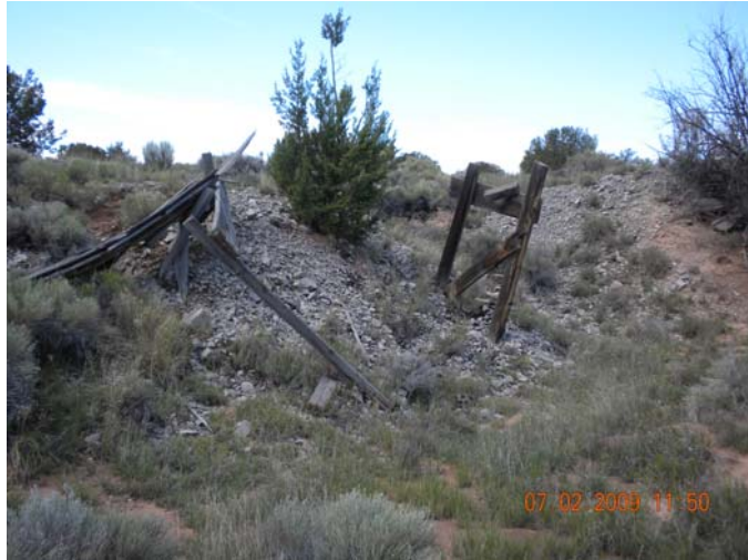
P1: Faith Mine Possible load-out structure remains along arroyo