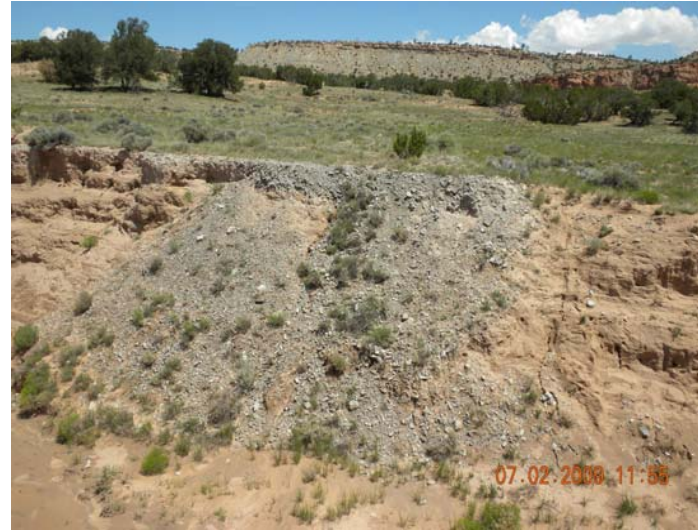
P2: Faith Mine view to northeast; waste cut by arroyo