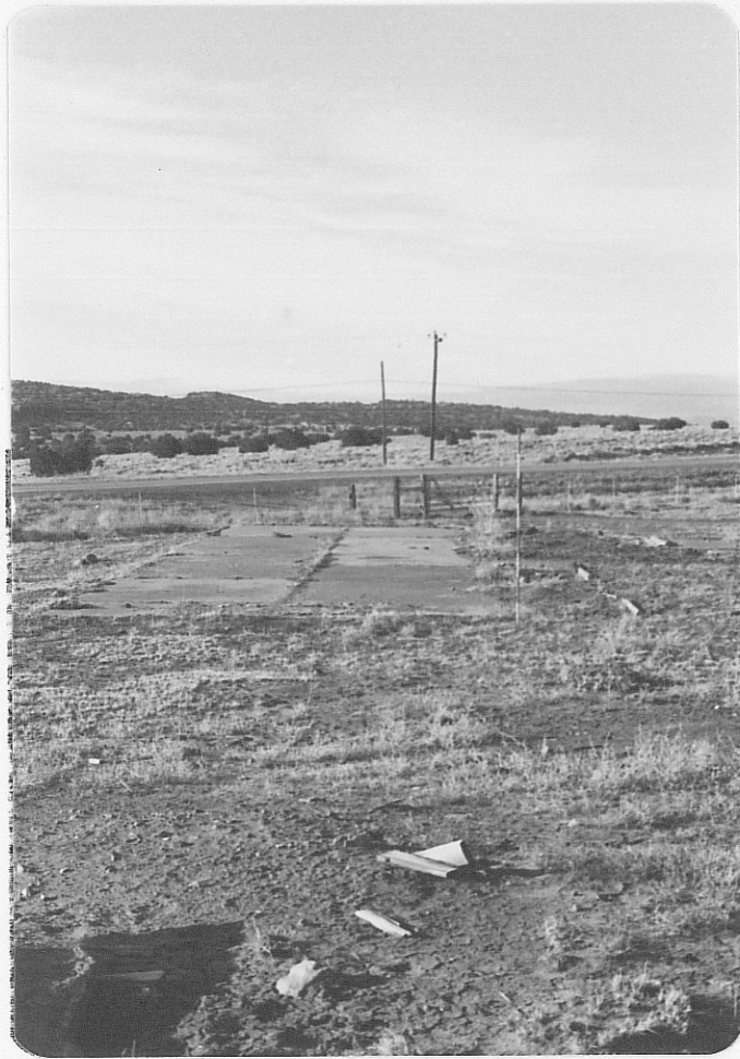
Photo (c) Looking southwest at concrete slab for hoisting equipment and maintenance shop.