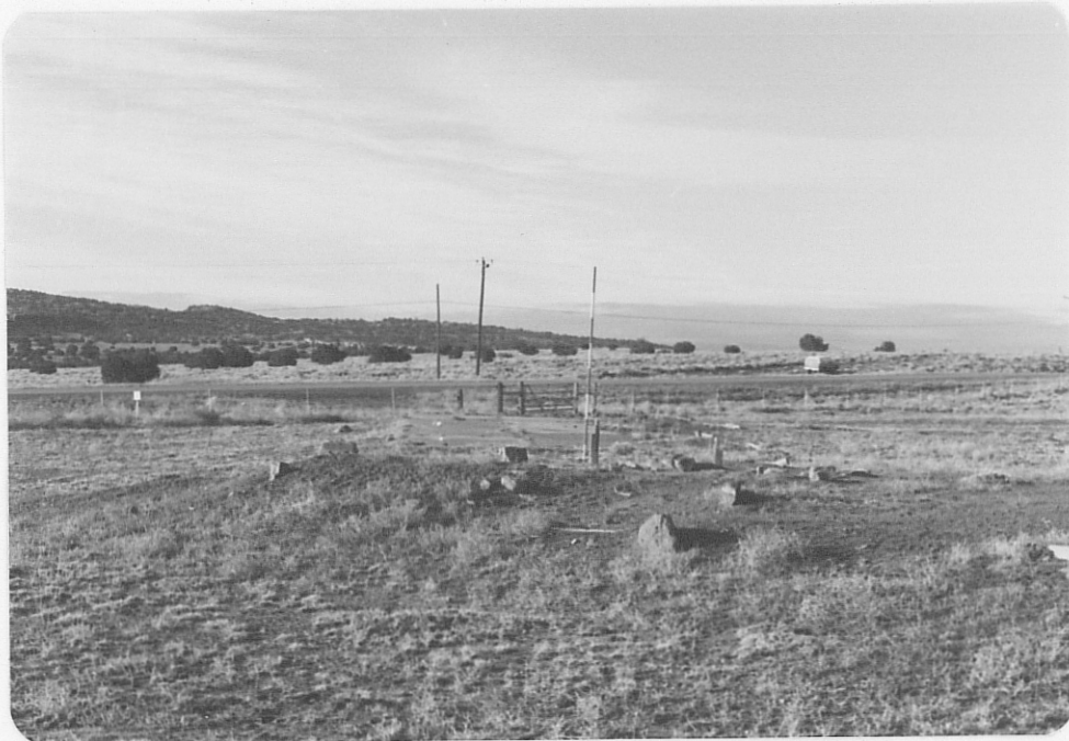
Photo (a) Looking southwest at Hogan Mine shaft site; note highway no. 53 in background and range pole (center) for scale.