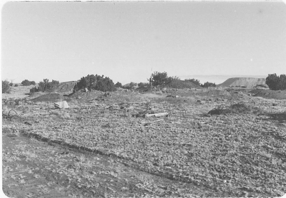
Photo (d) View northward at south edge of main dump area; note range pole (center) for scale.