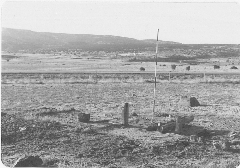
Photo (b) Close-up looking south at concrete slab over the mine shaft. Note head frame footing behind slab to right. A small amount of caving has begun near corner of slab at right. Marquez Mine is visible at center background.