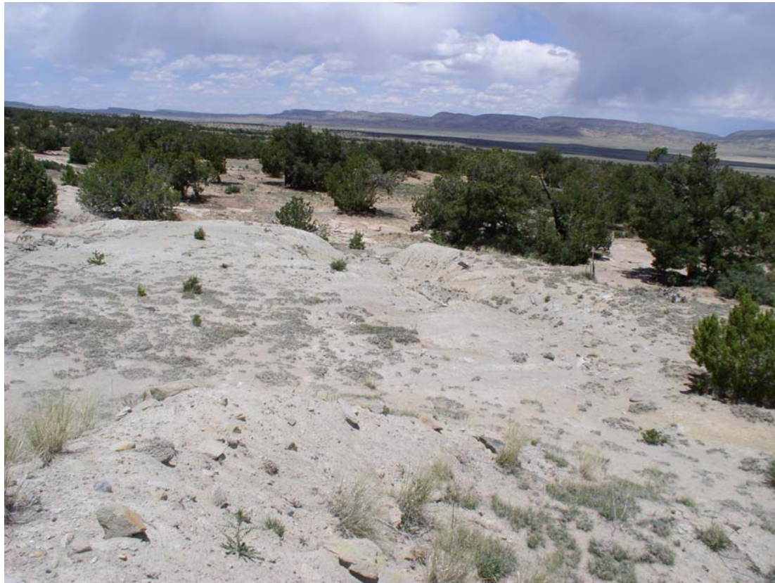
P1: Beacon Hill Gossett Mine waste pile

RE: Pre-CERCLIS screening Assessment of Beacon Hill Gossett mine, McKinley County, New Mexico September 10, 2009