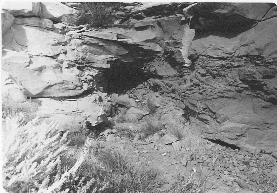
Photo B - Looking NW at adit entrance. Note hammer (circled) for scale.