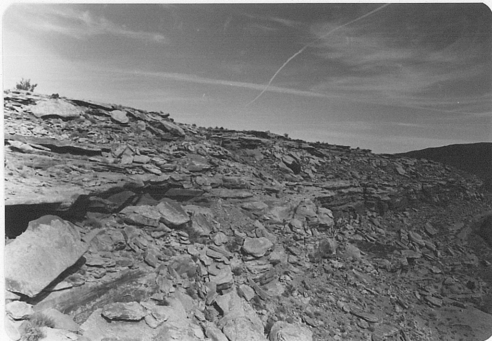
Photo A - Looking north at locations of the bench cut and adit on the Junction Claims.