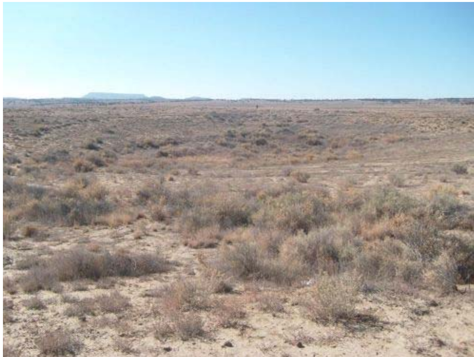
Photo 4. Large depression south of road