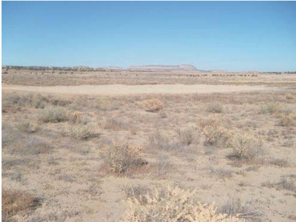
Photo 3. Covered area at the center of the site