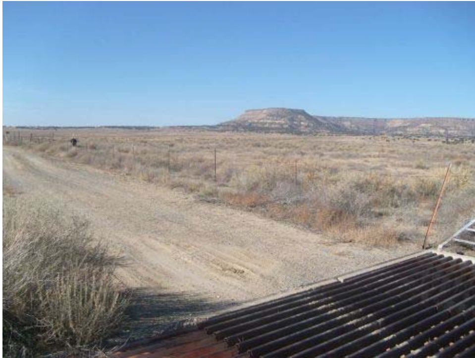
Photo 1. Kermac 22 mine site, towards west/southwest from road at northeast corner of site