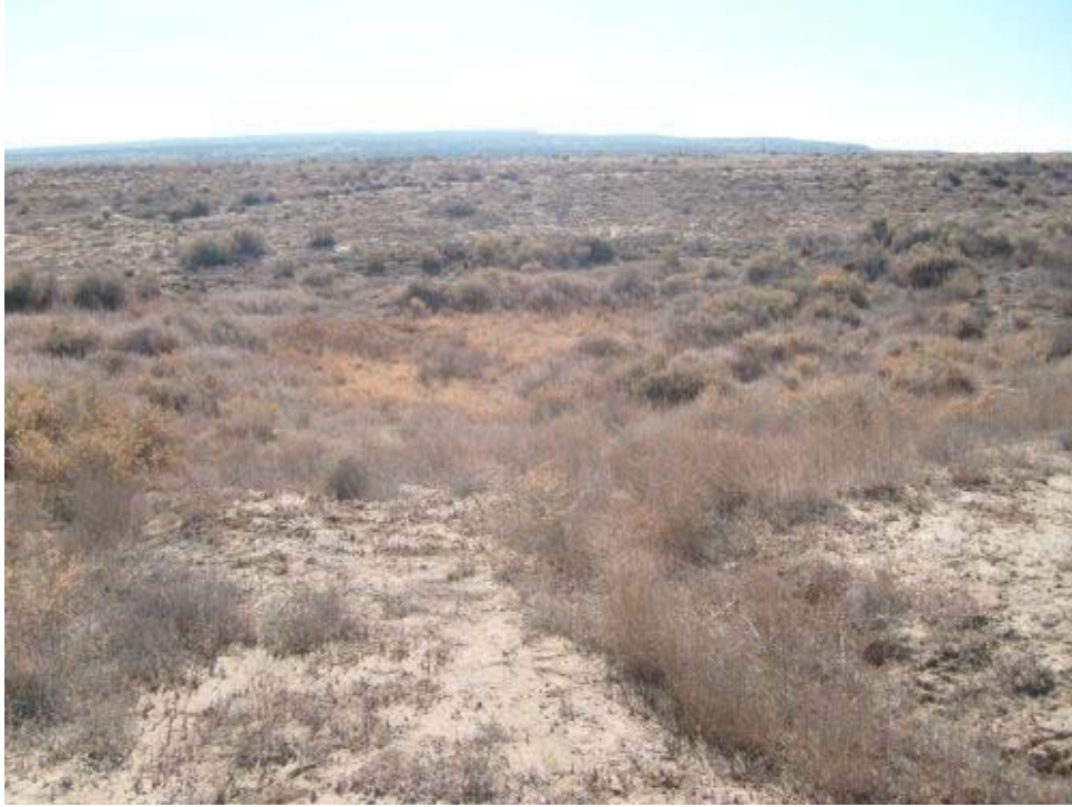
Photo 5. Large depression south of road