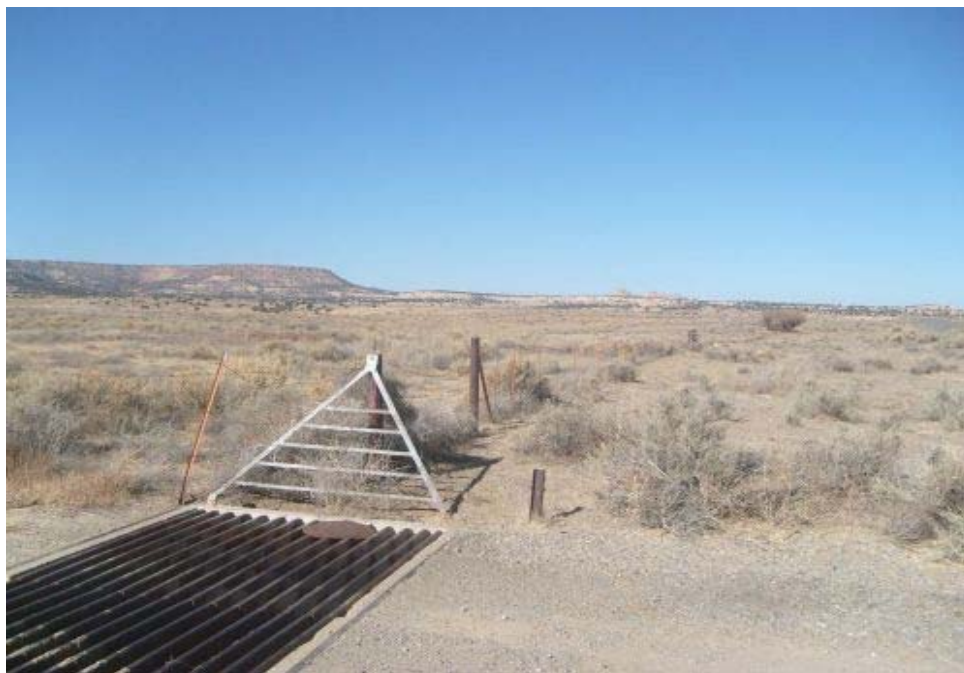
Photo 2. Kermac 22 mine site, towards west/southwest from road at northeast corner of site