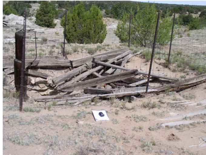
P4: Mesa Top Mine shaft