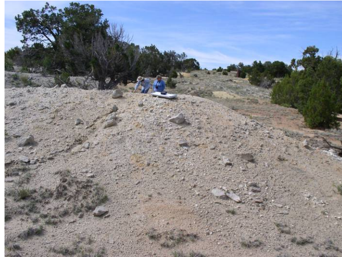
P2: Mesa Top Mine waste pile