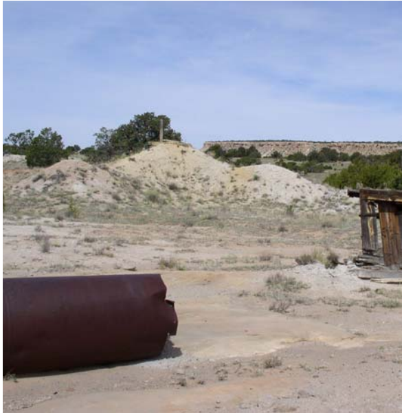
P5: Mesa Top Mine waste pile near load-out facility