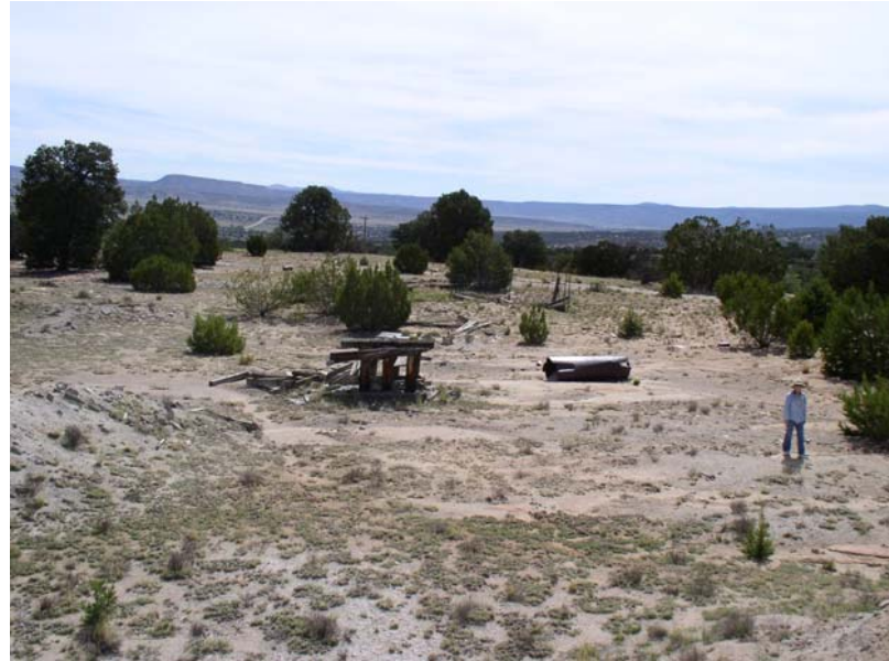
P6: Mesa Top Mine view from waste pile near load-out toward north