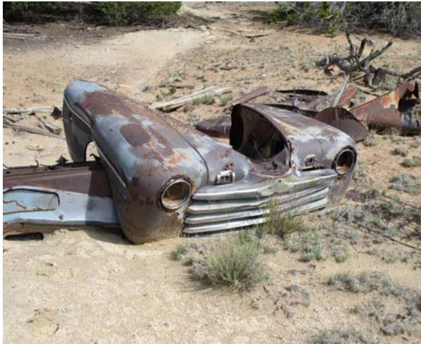
P3: Mesa Top Mine scattered automobile parts