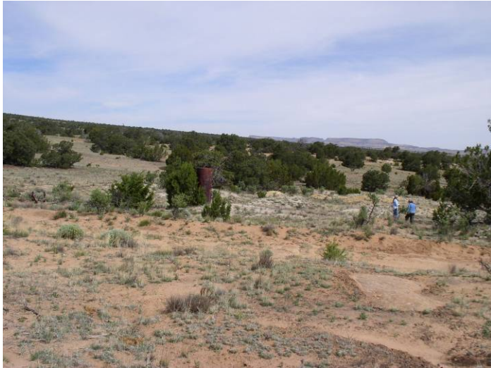
P1: Mesa Top Mine ventilation shaft