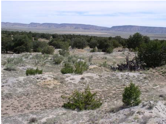
P7: Mesa Top Mine view from waste pile near load-out toward south