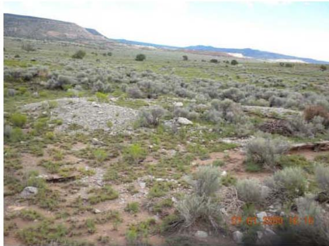
P1: Flat Top Mine shaft location; scattered limestone waste rock