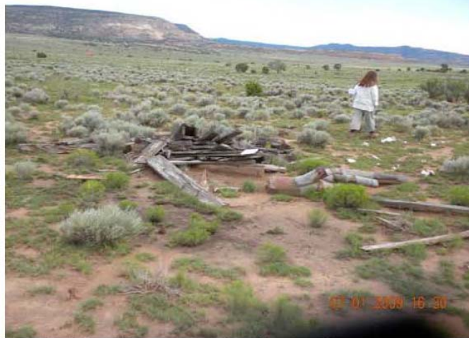
P2: Flat Top Mine reclaimed decline location