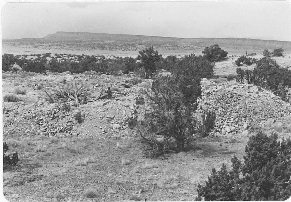
Photo (c) Looking northwestward at Christmas Day tailings dump area. —Note person in photo for scale.