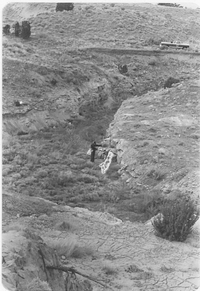
Photo (a) Looking westward into the east and south edges of the Christmas Day workings; blanket of aeolian sediment is here quite thick, often over 15'.