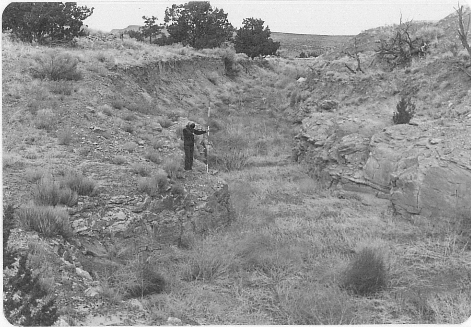
Photo (b) Looking northwestward into the western limb of the Christmas Day workings.