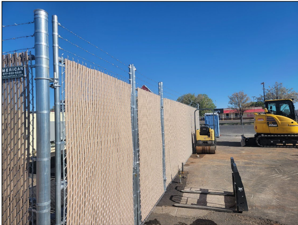
2. Privacy slats were installed on all chain link fence panels. Three strands of barbed wire were installed along the top of the fence.