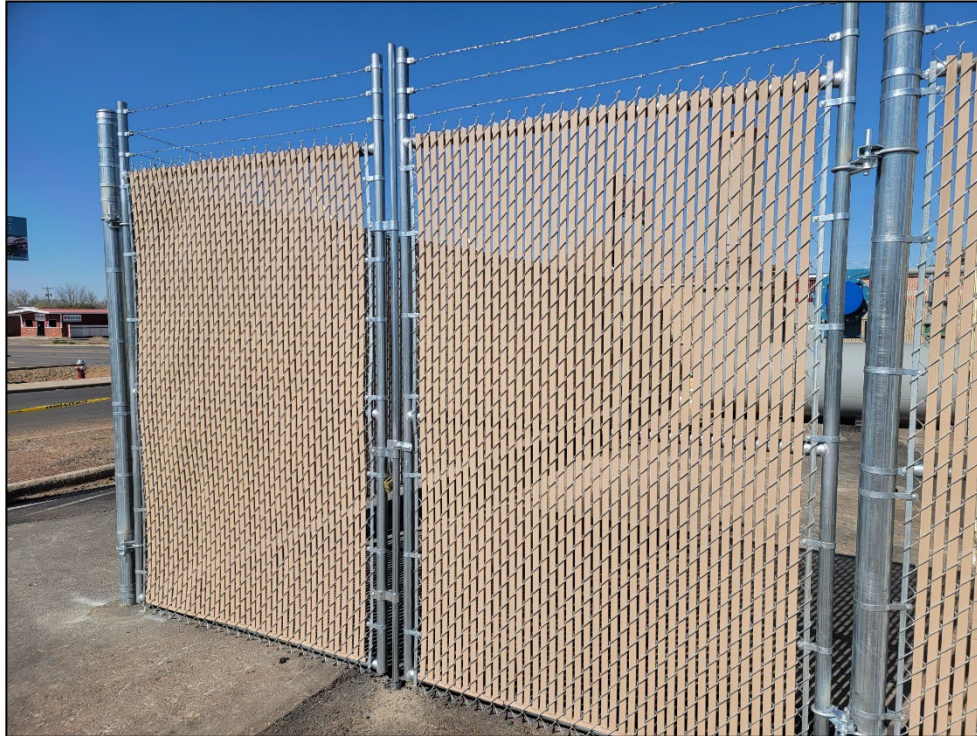
3. A 12-foot wide double swing gate was installed on the southeast corner of the fence near the groundwater treatment container doors.