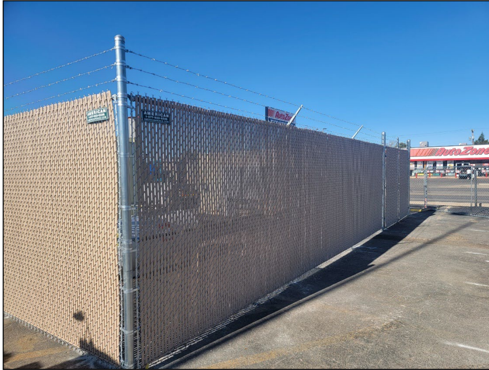
1. American Fence installed the new 8-foot tall chain link fence the week of April 11, 2022.