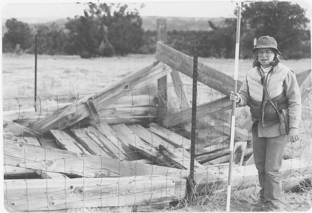
Photo (h) Close-up of Mesa Top 18, showing deteriorating planks covering shaft.