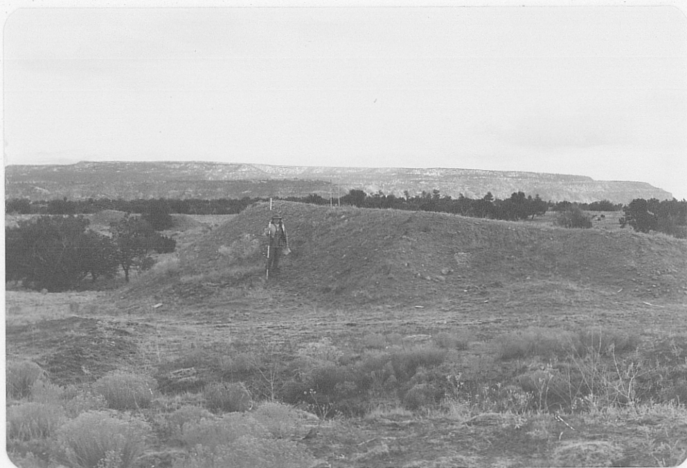
Photo (c) Looking southeast at waste dump from decline shown in (b).