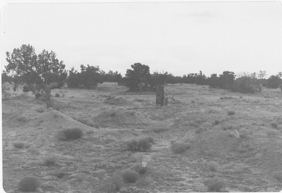
Photo (j) Looking southward at 30" diameter metal lined ventilation shaft and escapeway at Mesa Top 18 workings. Shaft is open and air inside lining is very warm.