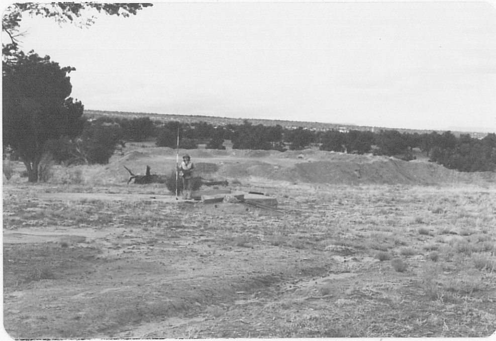
Photo (k) Looking westward at the Malpais raise site, about 900' northeast of Mesa Top 18 shaft; note mine dump in middle distance.