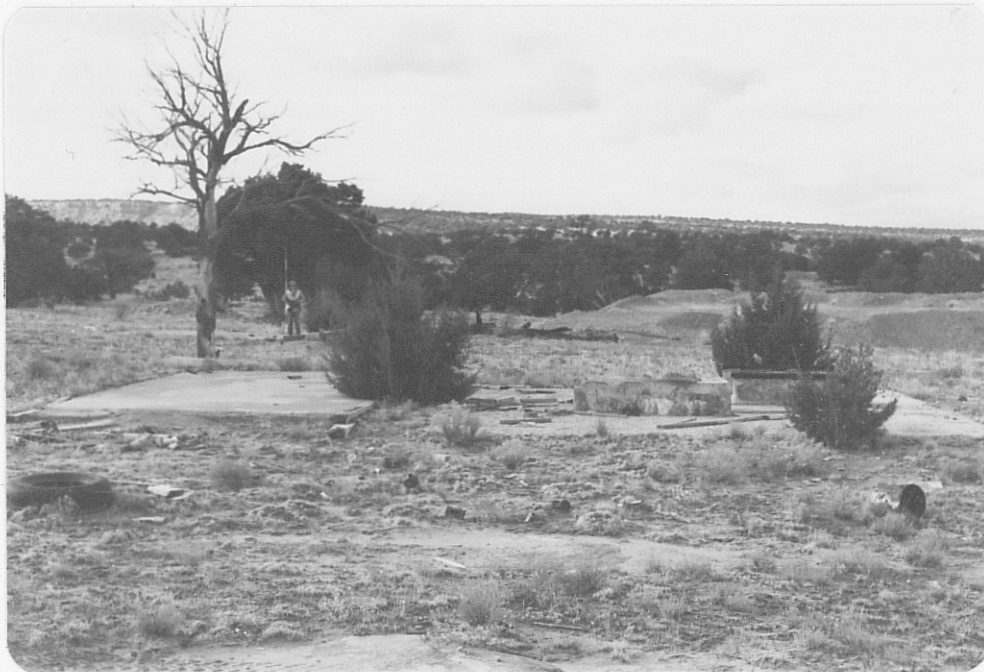
Photo (n) Foundation and concrete slab remaining at Malpais raise site.