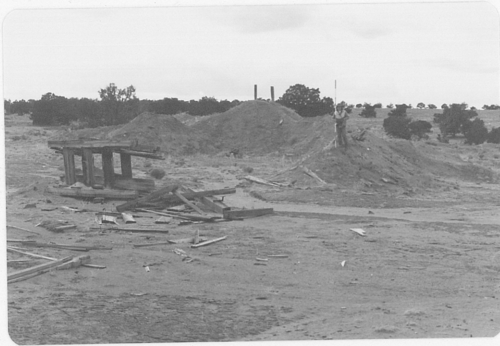
Photo (i) Looking SW at remains of wooden loadout facility and waste piles at Mesa Top 18 workings.