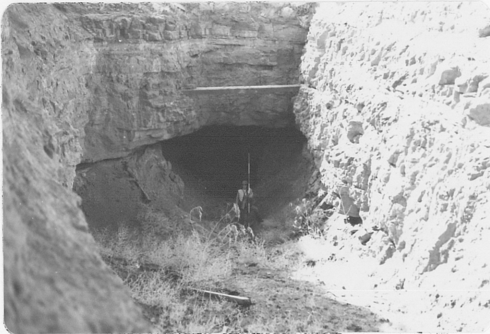
Photo (b) Close-up of decline shown in (a); portal is about 10' high, 14' wide.