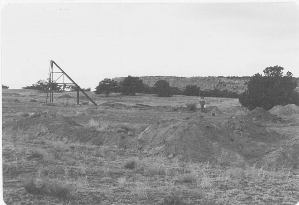
Photo (d) Headframe and waste piles at inclined shaft 1,000' northwest of one shown in (b); close-ups are shown in photos (e) and (f).