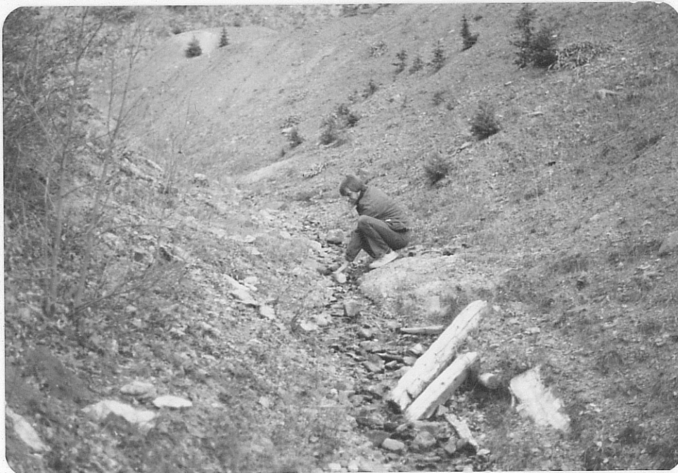
Photo (b) Stream sample taken at the west end of Black Copper Canyon workings.