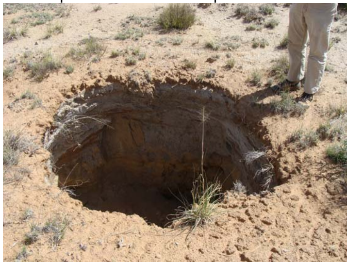
P2: Malpais Mine open shaft