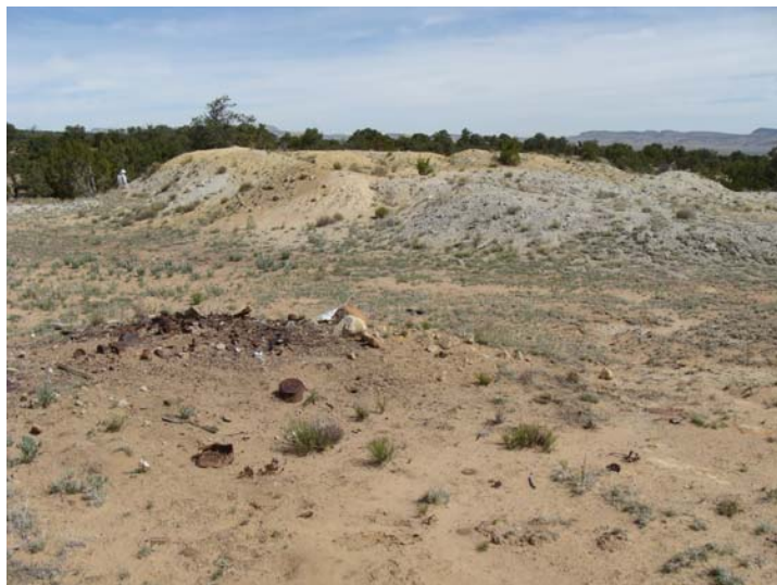
P1: Malpais Mine main waste pile