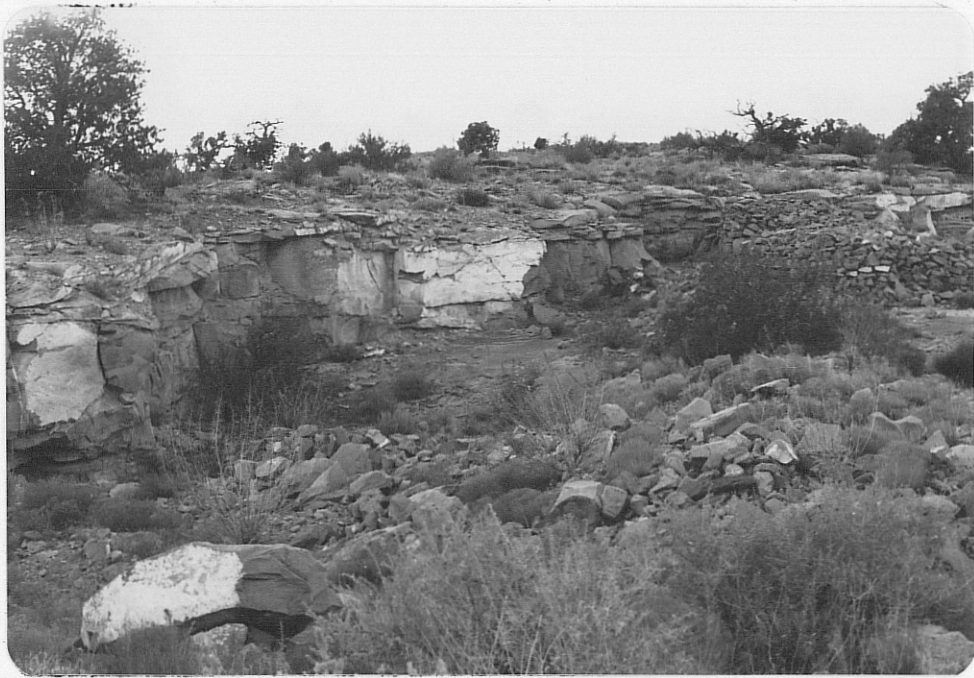
#2; looking west into open cut from access road. Area shown in photo b appears in center of photo c.