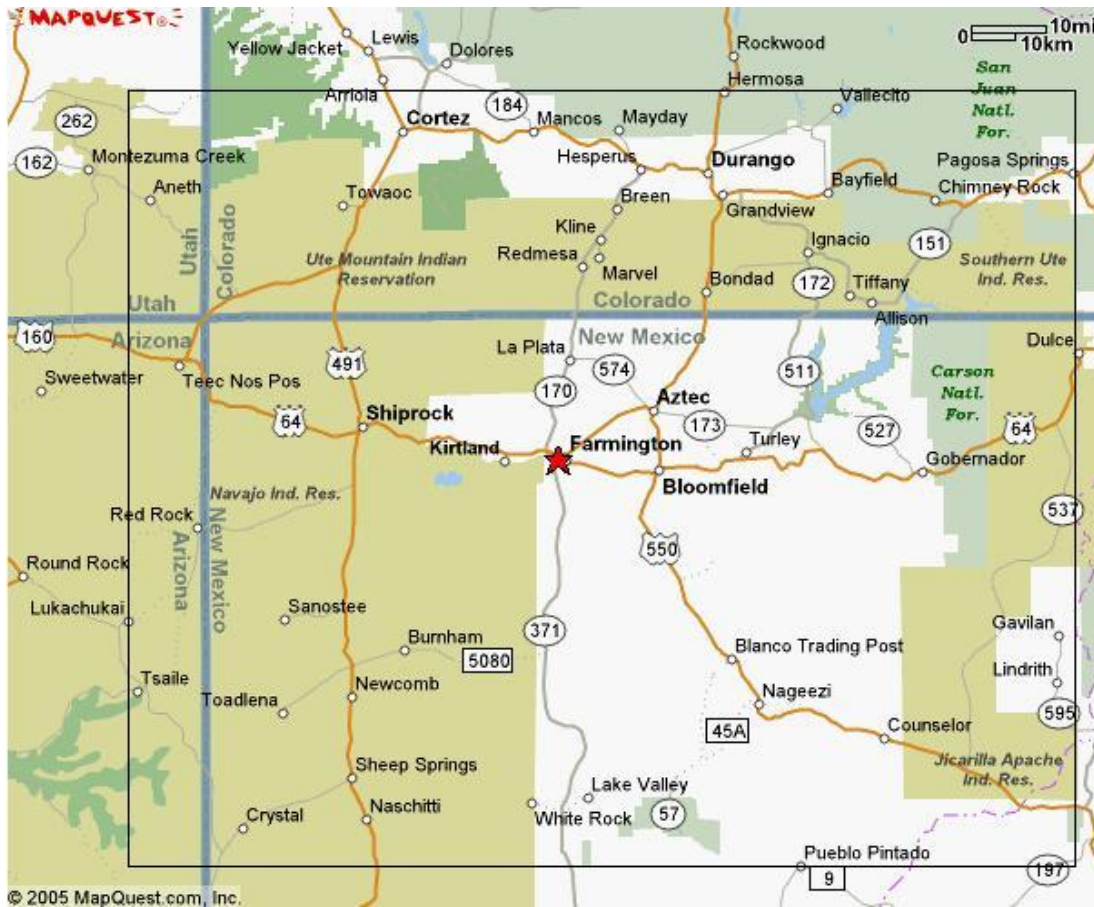
Figure 1: Map of General Four Corners Area.