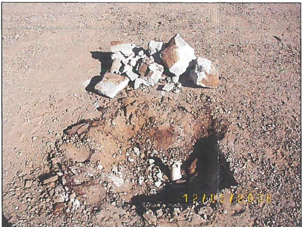
MW-1 - AFTER CONCRETE REMOVED