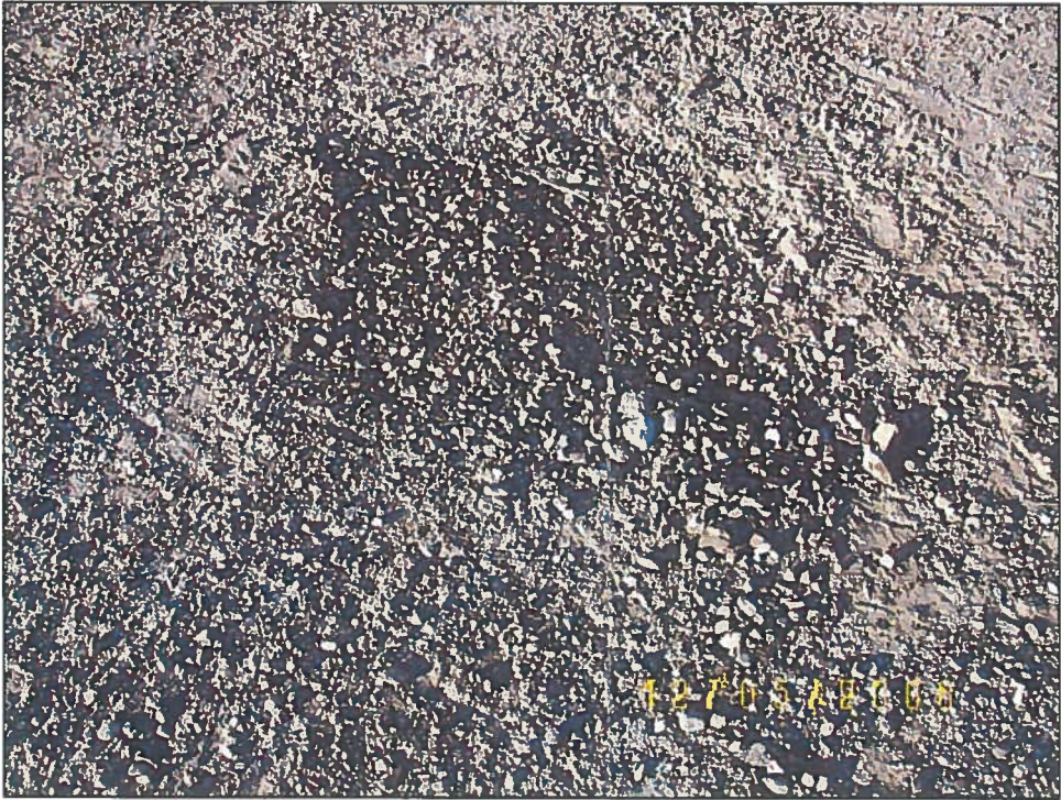
MW-2 - FINISHED COVER