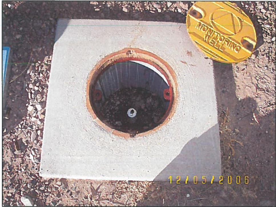
VM-1 - BEFORE ABANDONMENT

K:\01 Gas\Allsup 16111Q GMM November 06\Figures\PLUG & ABANDONED.dwg