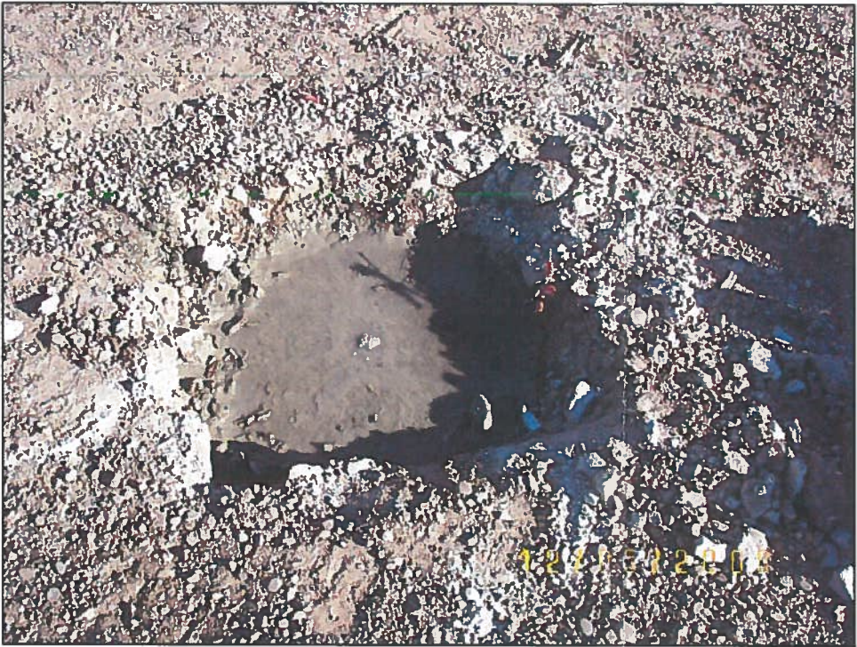
MW-2 - FILLED WITH BENTONITE / CEMENT GROUT BY TREMIE PIPE