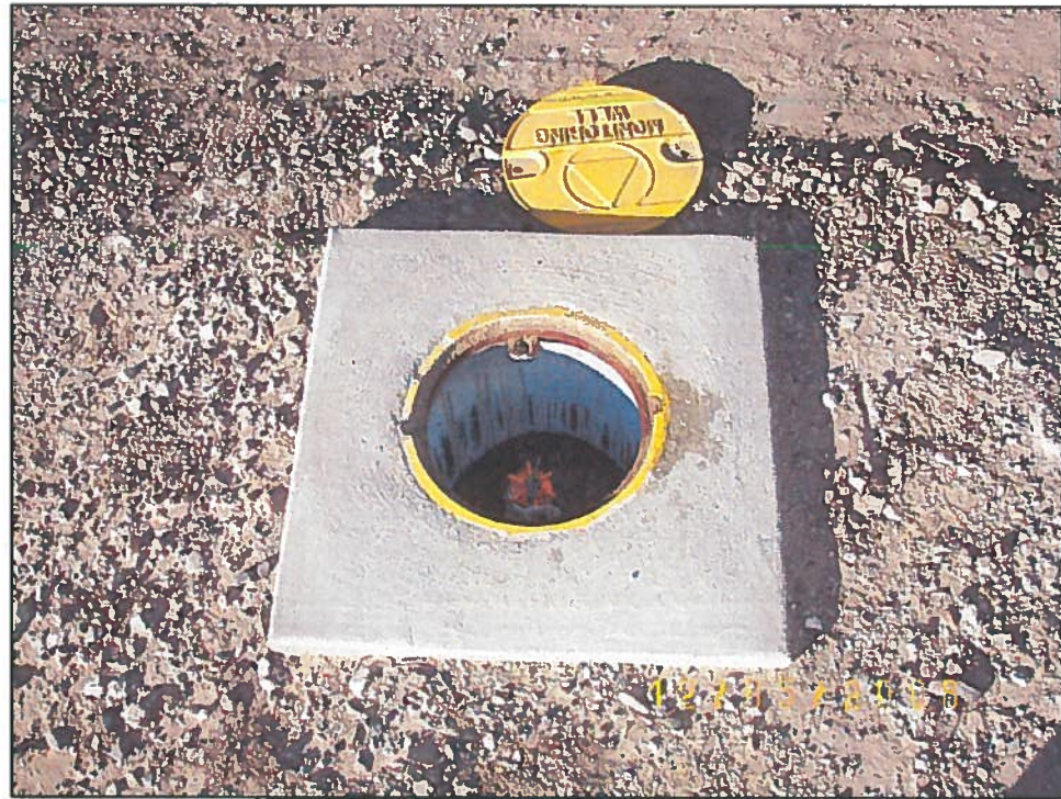
MW-4 - BEFORE ABANDONMENT