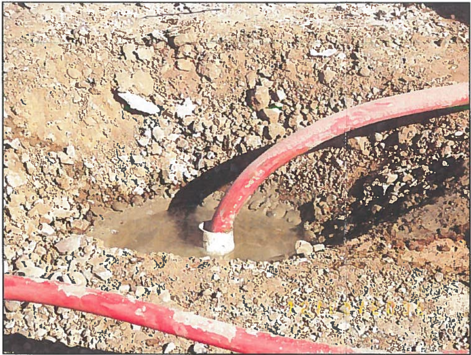
MW-4 - FILLING WITH BENTONITE / CEMENT GROUT BY TREMIE PIPE