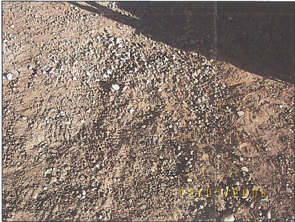
MW-4 - FINISHED COVER

K:\Oil_Gas\Allsup 16111Q GWM November 06\Figures\PLUG & ABANDONED.dwg