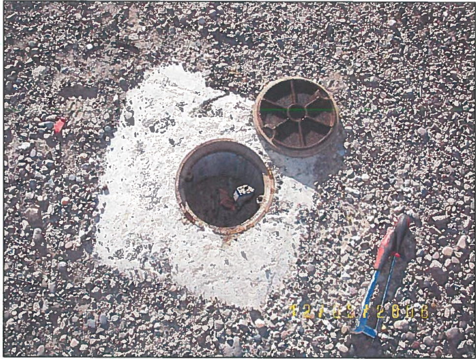
MW-2 - BEFORE ABANDONMENT

K:\Oil_Gas\Allsup 16111.Q GWM November 06\Figures\PLUG & ABANDONED.dwg