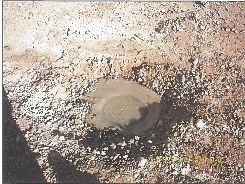
MW-4 - FILLED WITH BENTONITE / CEMENT GROUT BY TREMIE PIPE