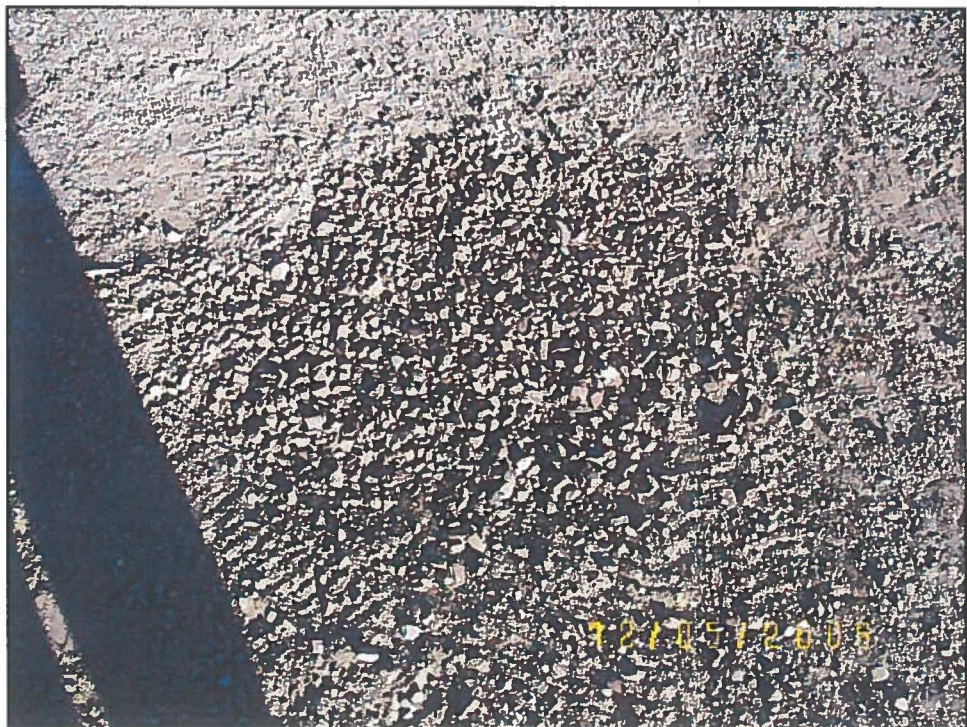
MW-1 - FINISHED COVER