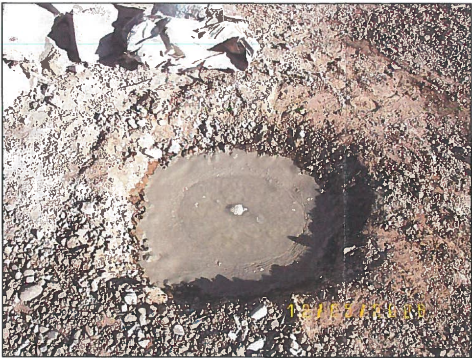
VM-1 - FILLED WITH BENTONITE / CEMENT GROUT BY TREMIE PIPE