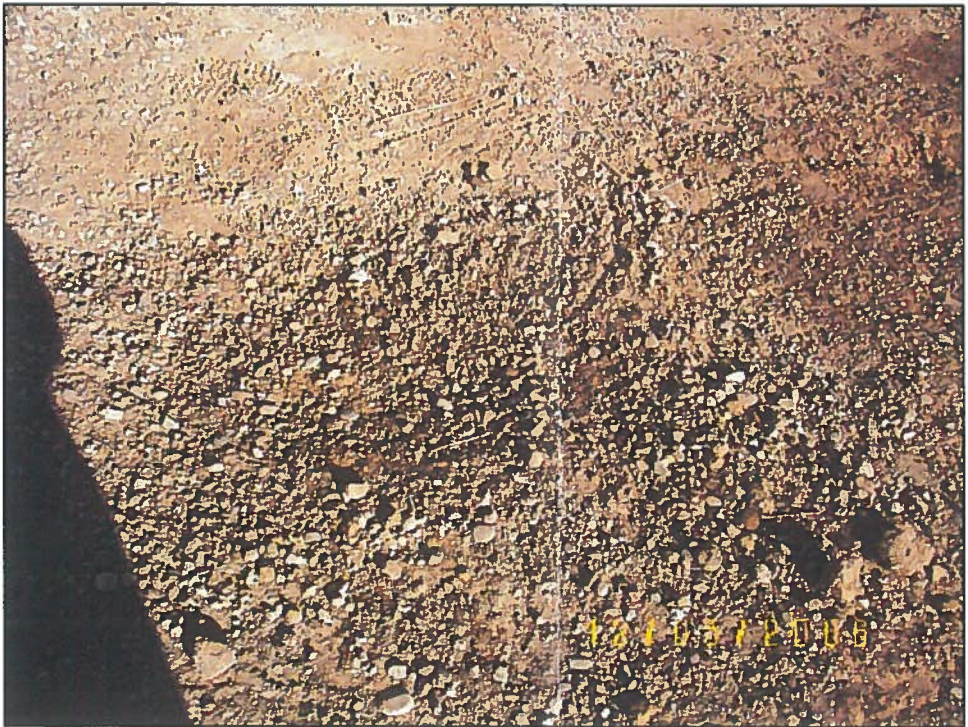
VM-1 - FINISHED COVER