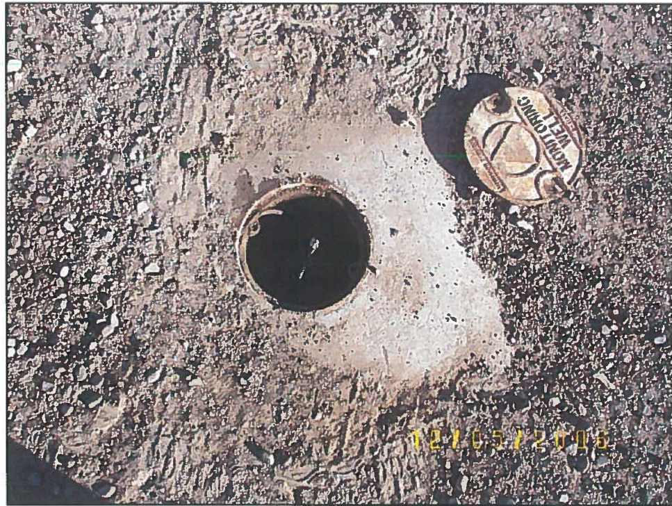
MW-1 - BEFORE ABANDONMENT

K:\OI\ Gas\Allsup's 16111Q GWM November 06\Figures\PLUG & ABANDONED.dwg