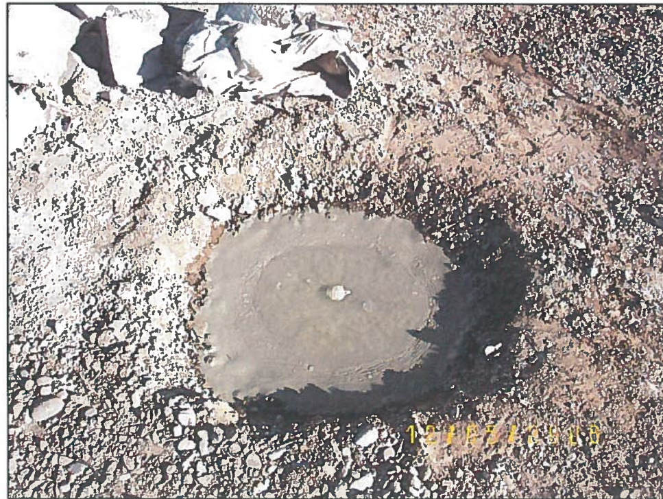
MW-1 - FILLED WITH BENTONITE / CEMENT GROUT BY TREMIE PIPE