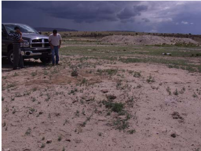
P1: Site of Bucky mine shaft