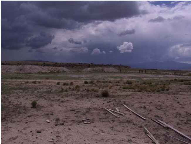
P3: Waste materials on Bucky minesite