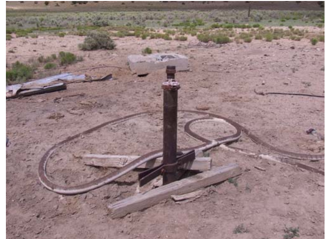
P2: Air supply shaft and line