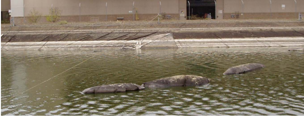
Figure 4. “Whales” in geomembrane of Case History #3 caused by leaking wastewater getting under the single geomembrane and forming biogas.

This problem could be fully addressed and managed through the installation and operation of a double geomembrane liner system with a leakage collection layer. The leakage collection layer would allow the simultaneous management of liquid leakage via the sump, and of biogas via perimeter vents.