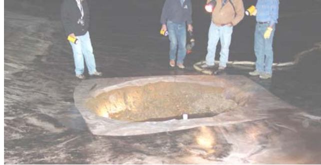
Figure 2. Photo of sinkhole in Case History #1.

because the probability for leaks is much greater at the locations of penetrations. It was clear that the leakage collection system that was installed was inadequate to safely control leakage, and that preferential uncontrolled leakage occurred in exactly the location where it would be most predictable. The remediation of this failure was eventually designed as a double geomembrane liner system with a blanket leakage collection layer.