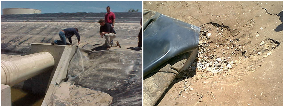
Figure 3. Photos of ripped geomembrane next to penetration, and sinkhole in Case History #2.

Case History #2. A single-geomembrane lined water reservoir was constructed on gap-graded sands near a river. Small leaks occurred where the geomembrane was attached to a large concrete pipe collar. Over a relatively short period of time, the leakage caused a sinkhole to form in the gap-graded subgrade soils. Photographs of the concrete penetration, and the gap-graded soils near the sinkhole, are shown in Figure 3. As the geomembrane was unsupported over the sinkhole, there was eventually a catastrophic collapse of the geomembrane. The remediation for this problem was to provide a double geomembrane liner system with a blanket leakage collection layer.