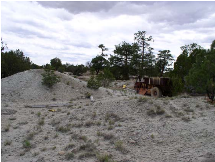
P2: Schmitt Decline waste pile