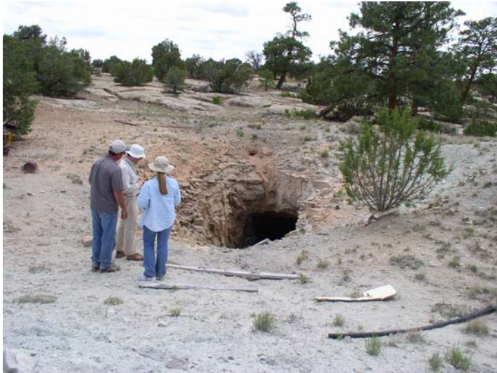
P1: Schmitt Decline