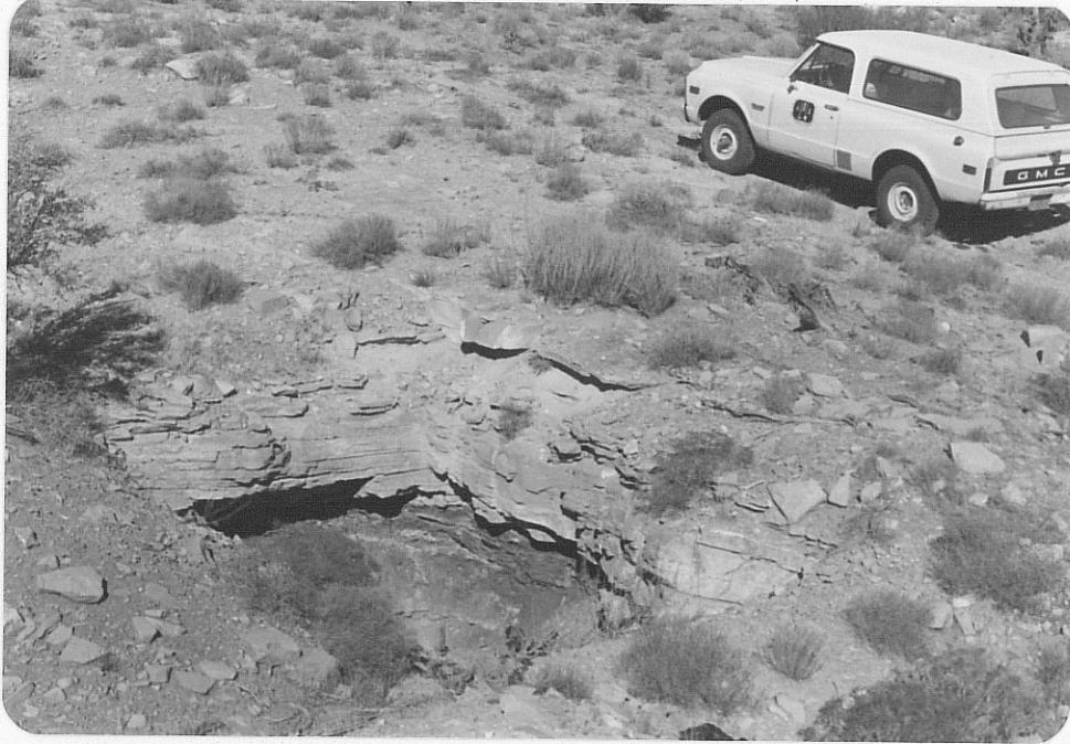
Photo (c) Upper Salt Rock workings; looking NW with 7' x 9' shaft in foreground.