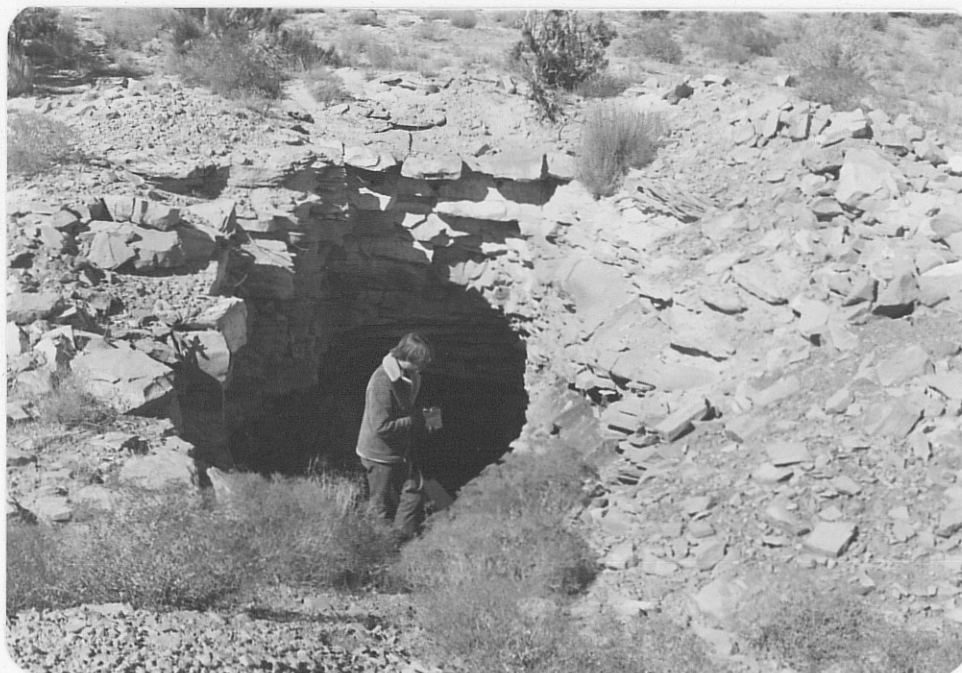
Photo (b) Upper Salt Rock workings; looking W into portal of 25' long adit.