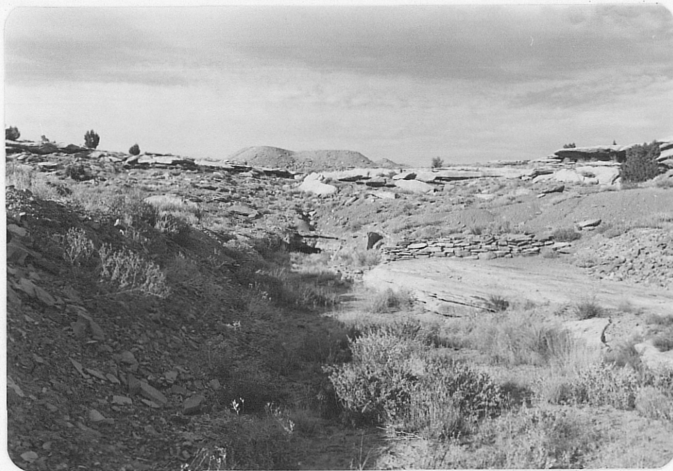
Photo (a) Tent Mine, looking N along 12' wide, 120' long, entrance cut.