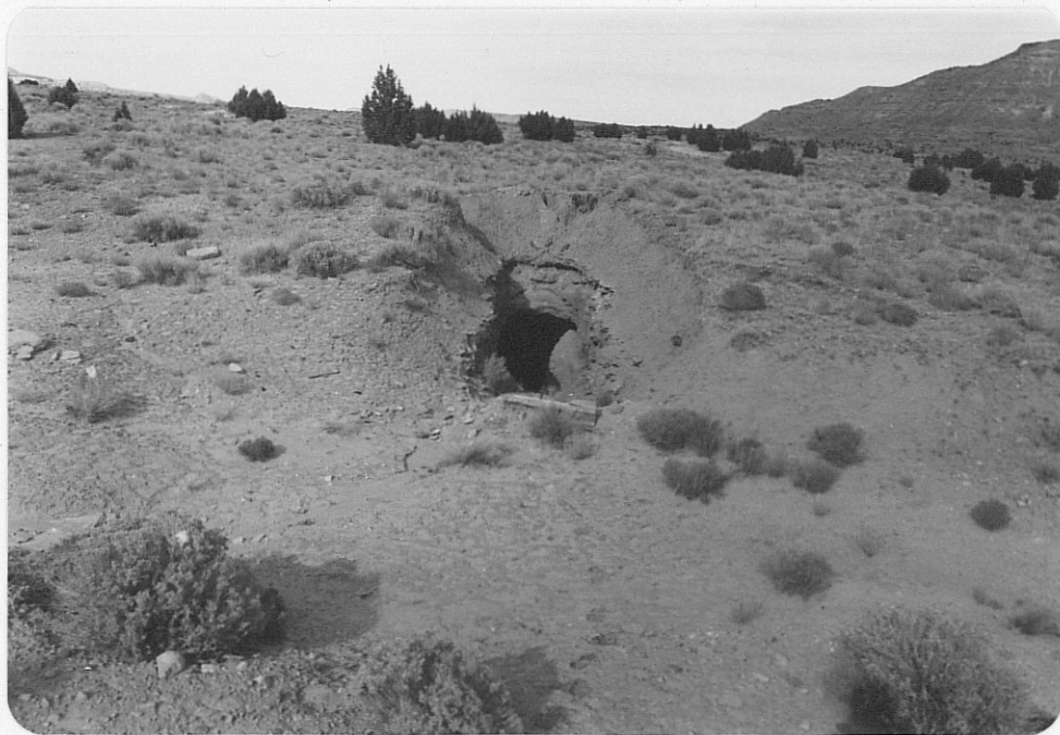
Photo A - looking north at entrance to Begay Incline. Note hammer on wooden post in foreground for scale.