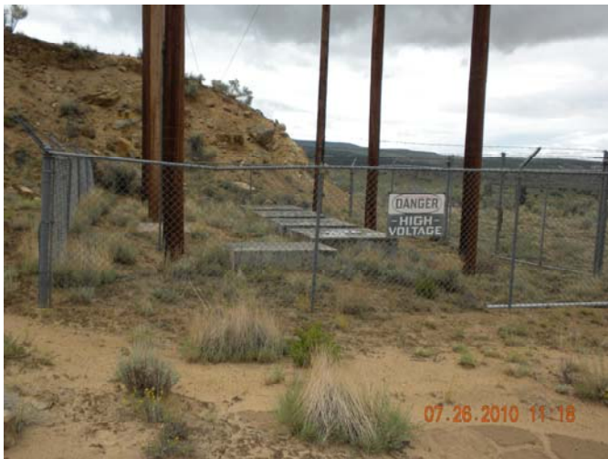
P7: Former substation location with 5 transformer pads