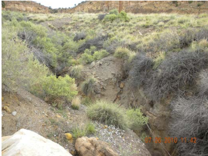
P9: View to north along drainage towards head of valley and minesite