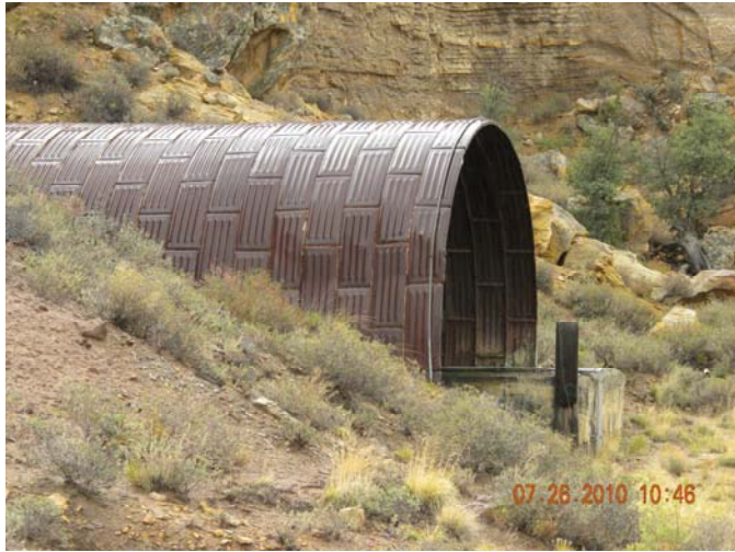
P1: View of vault to southwest from access road