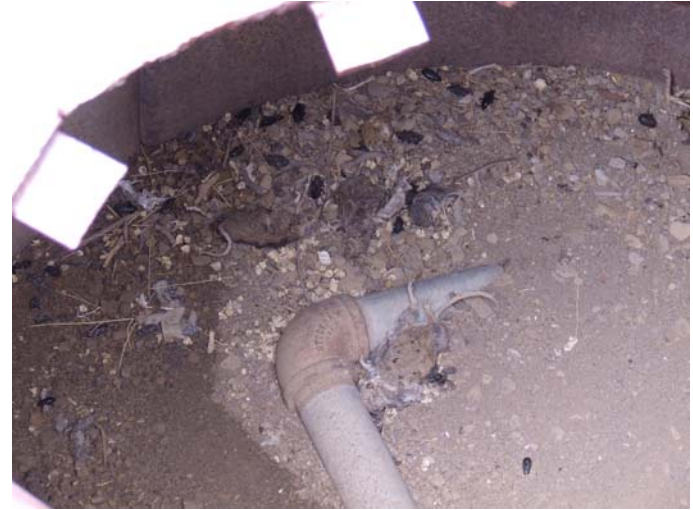
P14: View into a metal circular vault