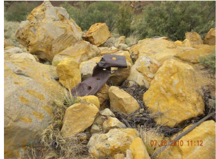
P6: Metal debris among sandstone boulders