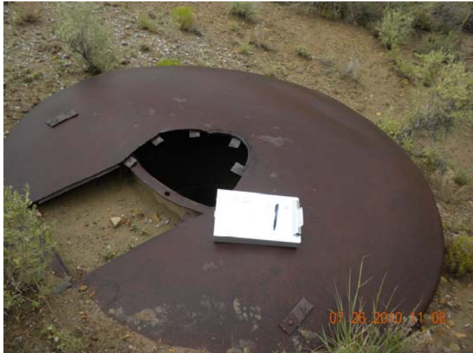
P5: ~5-ft deep vault with piping