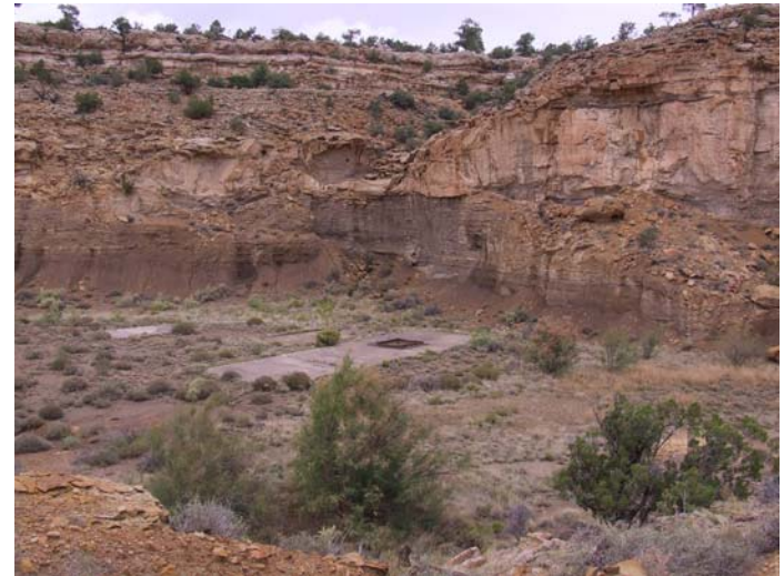
P16: View toward southeast of valley