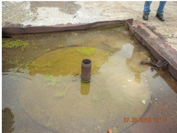
P11: Concrete pad with circular concrete plug and protruding pipe