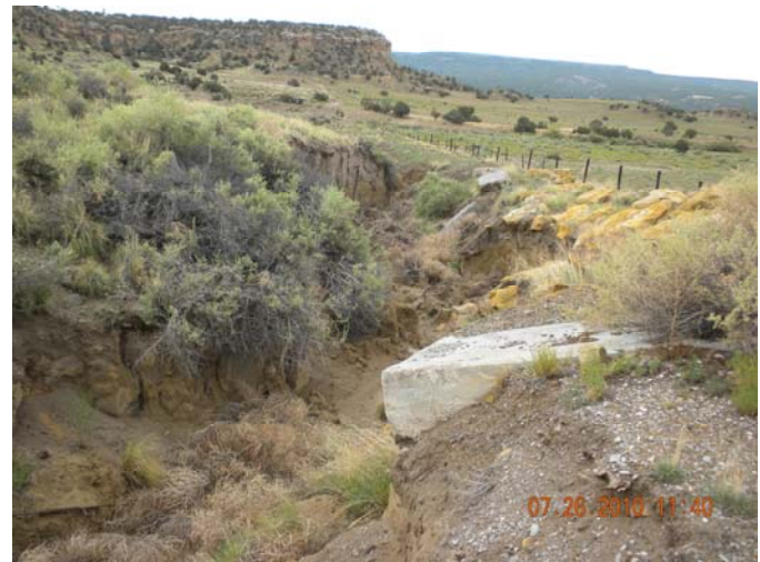
P8: View to south of concrete slab along drainage