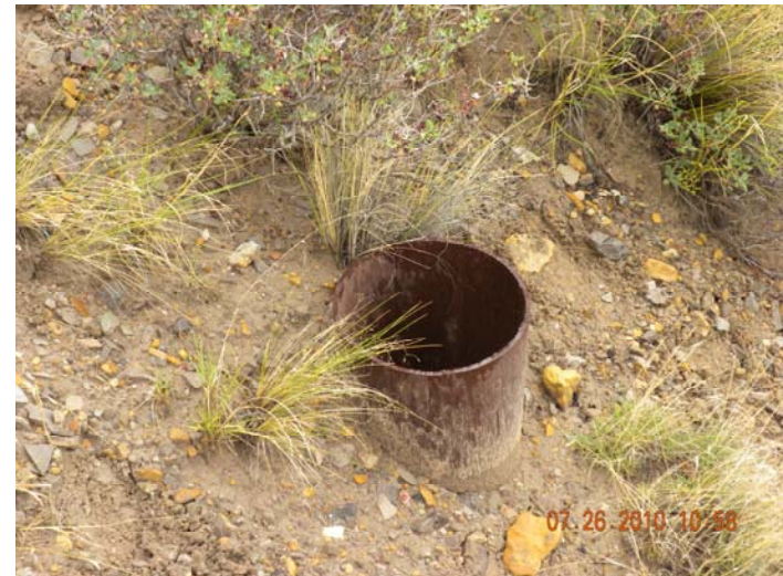
P4: Metal pipe, possibly containing well