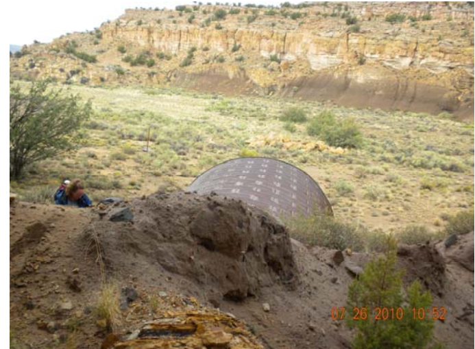
P2: View to west side of valley from above vault overhang