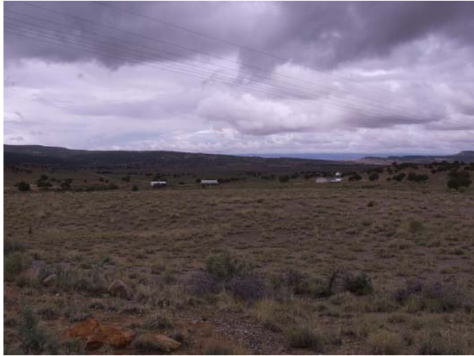
P13: View south from mouth of valley toward San Mateo Creek