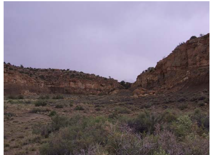
P12: View north toward head of valley