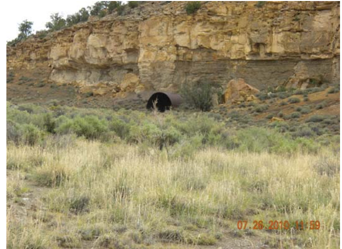
P10: View of vault entrance toward northeast