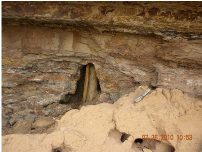
P3: View to east of utilities entering vault below through escarpment