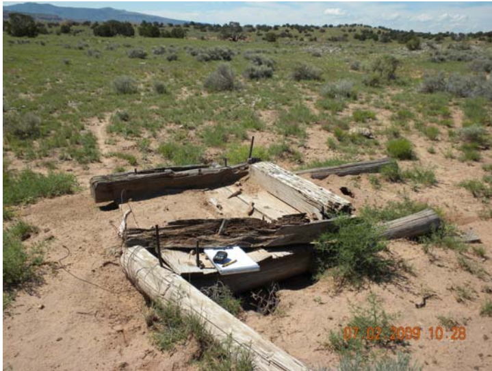
P1: Roundy Shaft mine open shaft