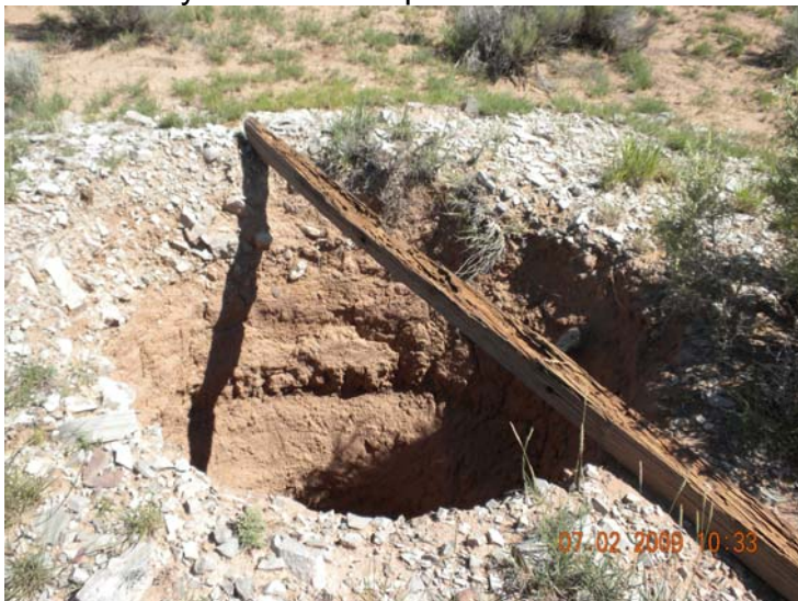
P2: Roundy Shaft Mine, open partially-caved shaft