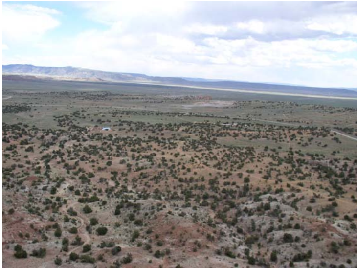
Blue Peak mine view towards southwest showing residences