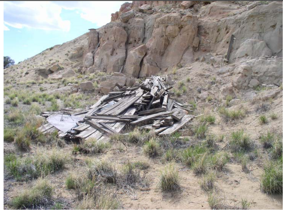
P2: Blue Peak mine load-out facility remains