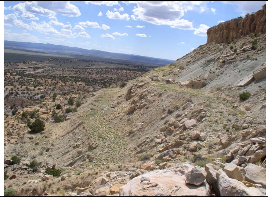
Blue Peak mine: view towards southwest