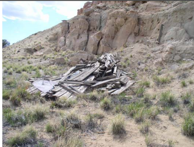
P2: Blue Peak mine load-out facility remains