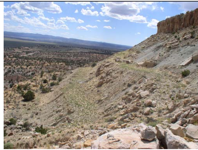
Blue Peak mine: view towards southwest