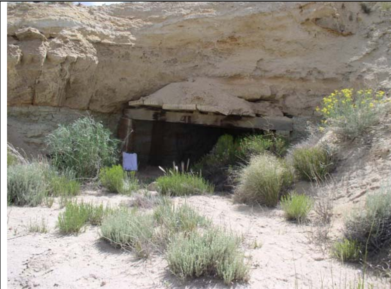
P1: Blue Peak mine open adit