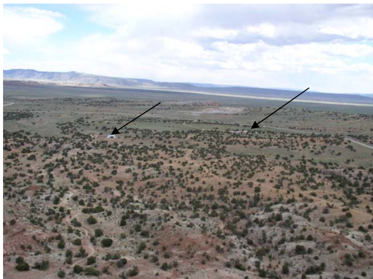
Blue Peak mine view towards southwest showing residences (arrows)