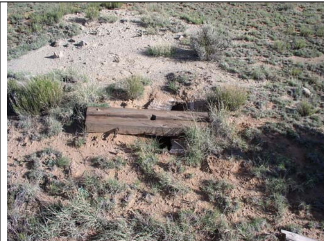
P3: Blue Peak mine open vent shaft on mesa top.