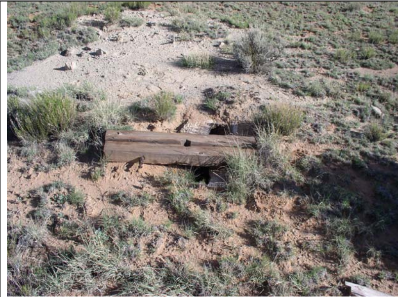
P3: Blue Peak mine open vent shaft on mesa top.