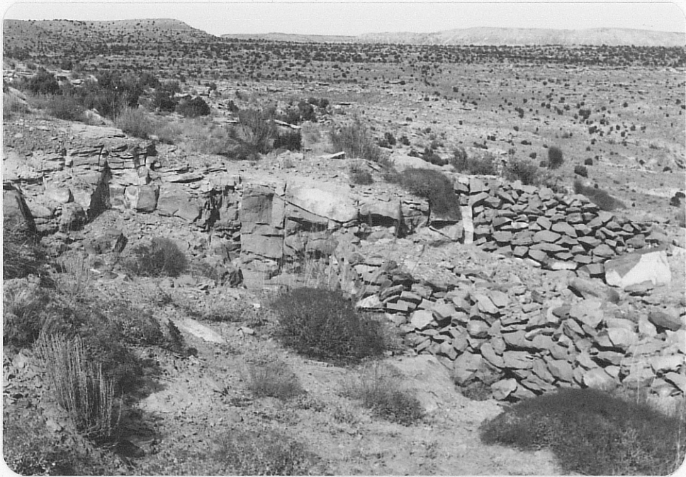
Photo (c) Williams Point mine; looking N at "stacked" waste rock characteristic of hand labor operations.