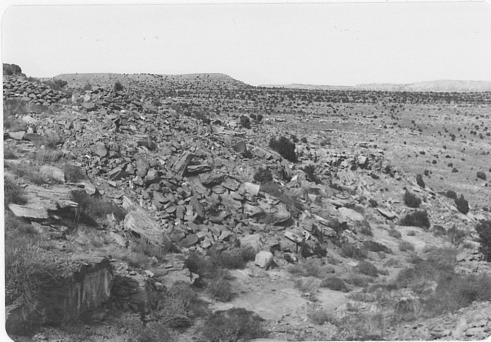
Photo (d) Williams Point mine; looking N at main tailings dump extending down slope from box cut.